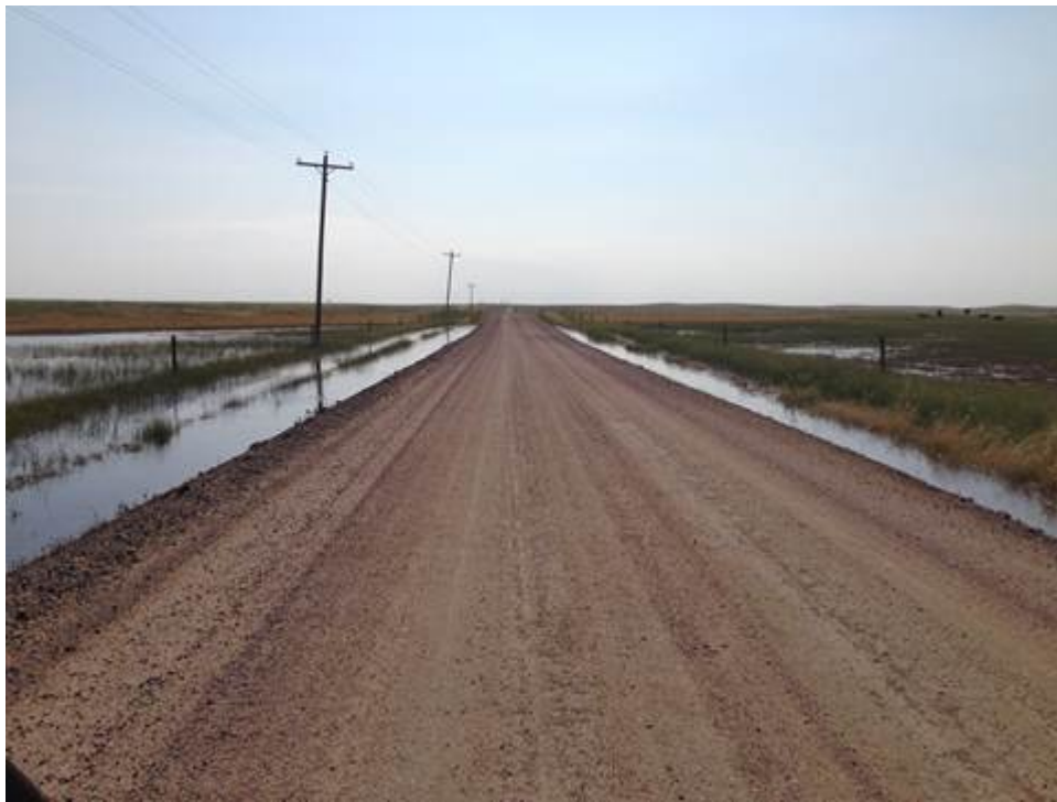
Over a week after our heavy rains, water still stands on the western part of the unit.