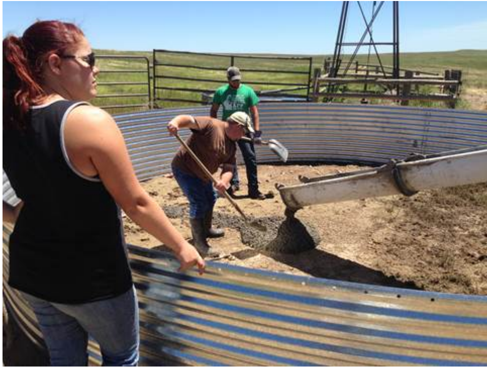
The Cheyenne crew helping to distribute concrete for our new water tank in the Highway pasture.

For more detailed precipitation data and maps, see our website: http://www.ars.usda.gov/Main/docs.htm?docid=24218 . As always, please feel free to send any questions, suggestions, or concerns relating to the project my way and I will do my best to respond in next week's email.